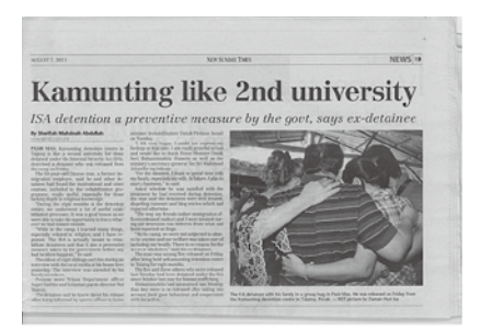
5.4 Kamunting like 2<sup>nd</sup> University (Abdullah, SM)

Although there is no definite reason to suspect overt discrimination, when we discover that the sport is dominated by Chinese Malaysians, we might wonder why the players are not more openly celebrated. With 1Malaysia in mind, perhaps this advertisement represents a missed opportunity to acknowledge their world-class abilities. The advertisement is there to wish the players good luck, which makes the omission of their faces an unfortunate one. However, as most texts draw on several discourses, there are several potential readings of this text: the creators of the image might feel that the image transcends ethnicised readings, the cost of paying for image rights of the players might have been too expensive, and there may have not been enough time to photograph the actual players. Without discussion with the creators of this image, all we can do is surmise.