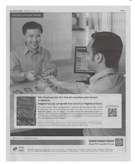
5.5 Kuwait Finance House advertisement with a smiling Chinese Malaysian

newspaper refer to him as Chinese? The case is different in the Maybank advertisement, where we have three high class sports players who competed in the name of Malaysia. It may have been impossible to arrange, but an emphasis upon their Chinese Malaysian identities would have been a gesture in the spirit of a true 1Malaysia . In any case, one month after the publication of the Kamunting article, the government scrapped the ISA after it having been on the statute book since colonial days. Perhaps this was another sign that the government was listening to the demands of the rakyat.